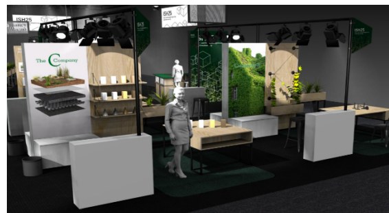
Exemplary layout / design